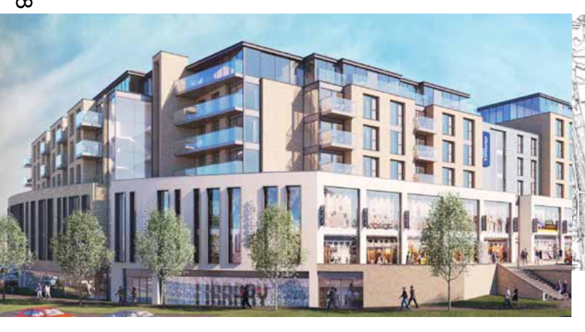
New river retail development

This project will complement the delivery of enhancements along the A2300 corridor, which are essential for improving the town's link to the strategic road network. With a successful Local Growth Fund application, work will start on site in Autumn 2017 with various elements completing to 2025.