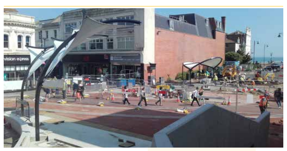
Works for Phase 1 of the Worthing Sustainable Transport Package started on site in January 2016.