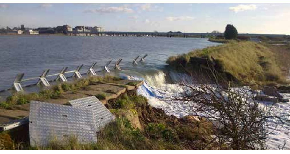
The planning application for the Adur Tidal Walls Flood Defence Scheme in Shoreham was approved in March 2016. A preferred contractor was selected and construction is due to begin in Summer 2016.

West Sussex County Council and Mid Sussex District Council continued to work together to develop the business case for the Burgess Hill A2300 Corridor Improvements Scheme. The Scheme will support the economic growth of Burgess Hill – the single largest growth location within the City Region – by enabling the delivery of strategic housing and employment developments and improving the town's link to the strategic road network.